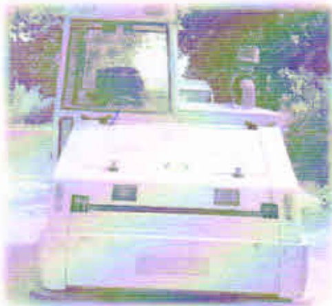
AUTOMATIC ROAD SWEEPING MACHINE

Automatic road sweepers have been procured for the road sweeping resulting in the reduction of fugitive emission from the manual sweeping. All the swept material is being reused in the cement process.