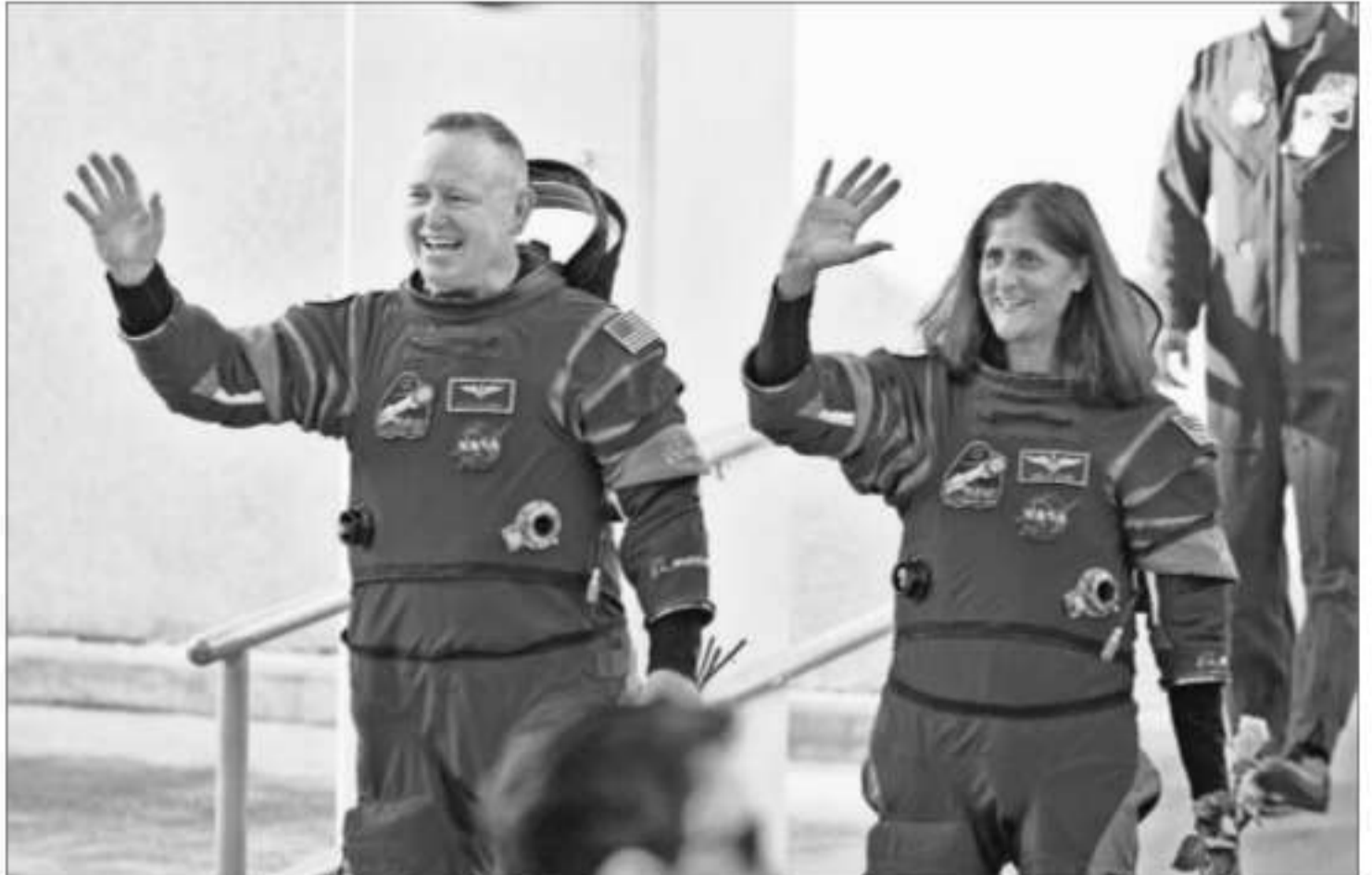
NASA astronauts Butch Wilmore (left) and Sunita Williams were launched on the Boeing Starliner capsule for a trip to the international space station on Wednesday

In 2012, during a prior trip to the International Space Station, Williams became the first person to finish a triathlon in space, during which she simulated swimming using a weight-lifting machine and ran on a treadmill while strapped in by a harness so she wouldn't float away.