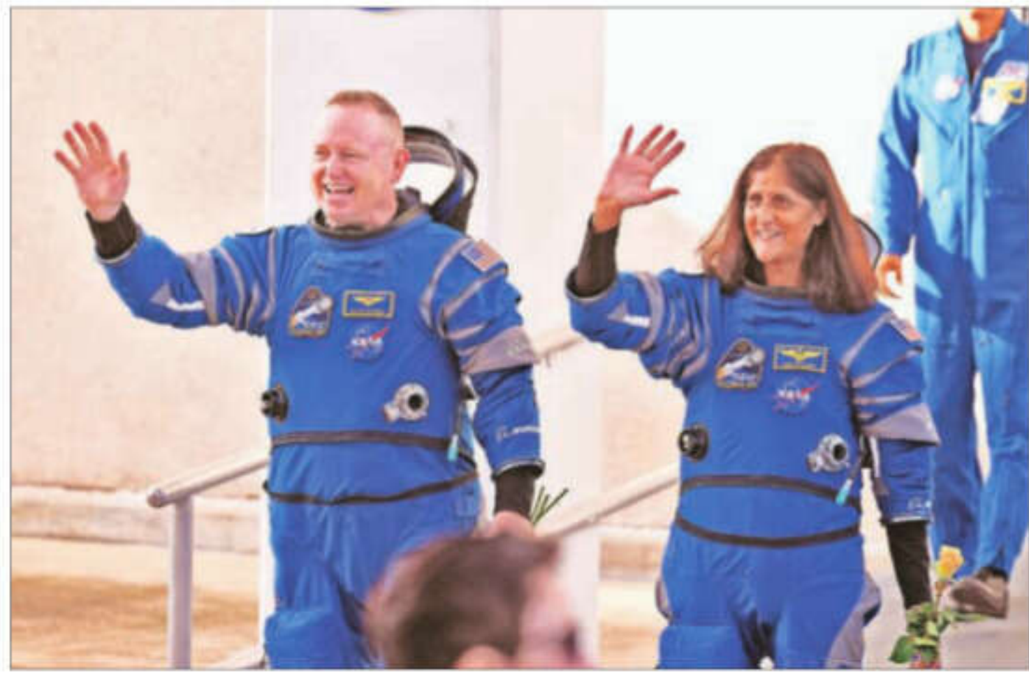
NASA astronauts Butch Wilmore (left) and Sunita Williams were launched on the Boeing Starliner capsule for a trip to the international space station on Wednesday

In 2012, during a prior trip to the International Space Station, Williams became the first person to finish a triathlon in